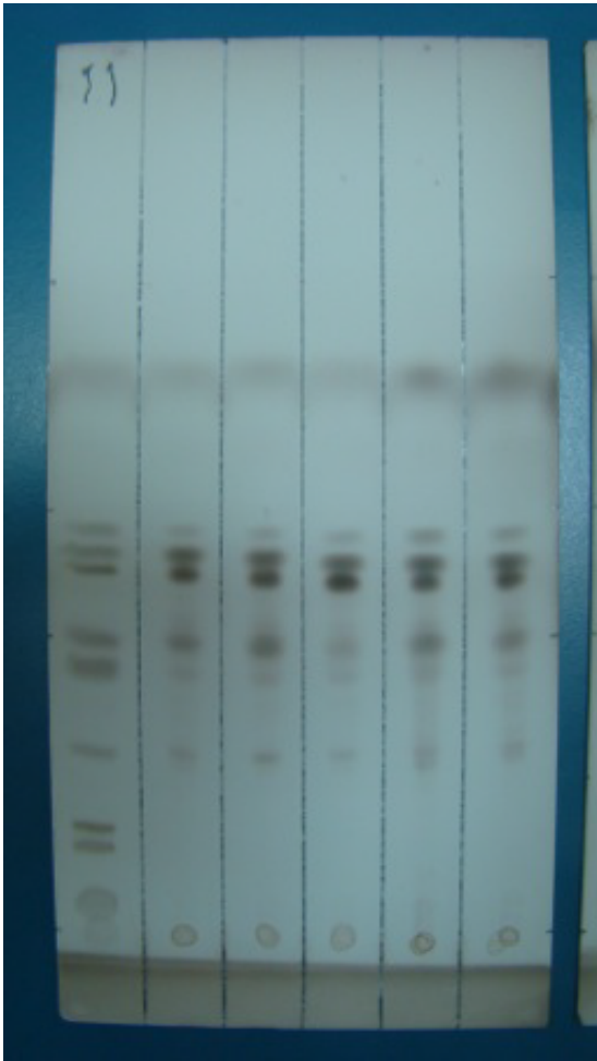
Figure 1. The sebum samples and standards are shown in one of the HPTLC plates.

the groups were not significantly different ( P > 0.05 ). The smoking rate was 20% and 15% in the demodicosis group and control group, while the percentage of alcohol use was 6.7% and 7.5% in the demodicosis group and control group, respectively. There was no statistically significant difference in terms of these parameters.