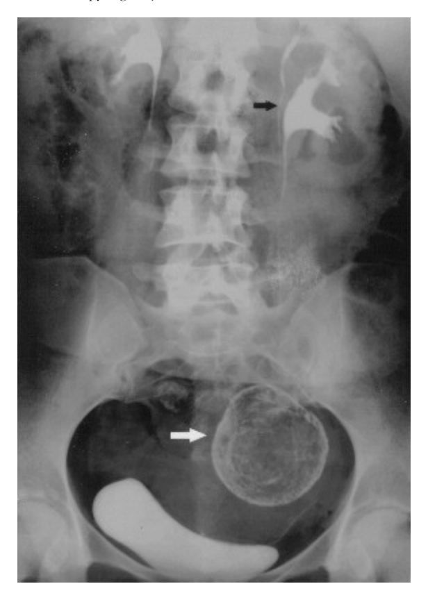
Figure 1: Duplication of the renal collecting system (black arrow) and leiomyoma with distrofic calcification (white arrow) in intravenous pyelogram.)

appendectomy, omentectomy, and transverse sigmoidostomy were performed. During the operation double ureter were observed at the left side. Histopathologic examination revealed adenocarcinoma of the descending colon including mucinous component and leiomyoma uteri with distrofic calcification (Figure 3).