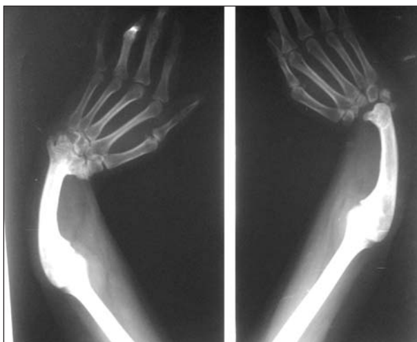
Figure 1. X-ray of the patient showing bilateral absence of radii.

A 25-year-old male was admitted to the neurology clinic for drug-resistant simple partial seizures characterized by the sensations of falling, urge to urinate, and feeling thirsty. Secondary generalized seizures were controlled by antiepileptic medication. The seizures had started at the age of 2. There was no consanguinity between parents. The physical examination revealed bilateral short upper extremities and lower extremities with genu varum and valgus of the feet. His older brother had similar limb defects and died in the first year of life. It was reported that his father's sister also had a daughter with similar limb abnormalities. The patient's chromosomal investigation had been done during childhood and was reported as normal 46, XY karyotype. Other investigations in the past considering renal and cardiac anomalies had been reported as normal. The laboratory examinations were normal except for platelet count, which was decreased (77.000/mL). The X-rays of his arms showed the bilateral absence of radii (Figure 1). Interictal EEG recordings showed sharp slow