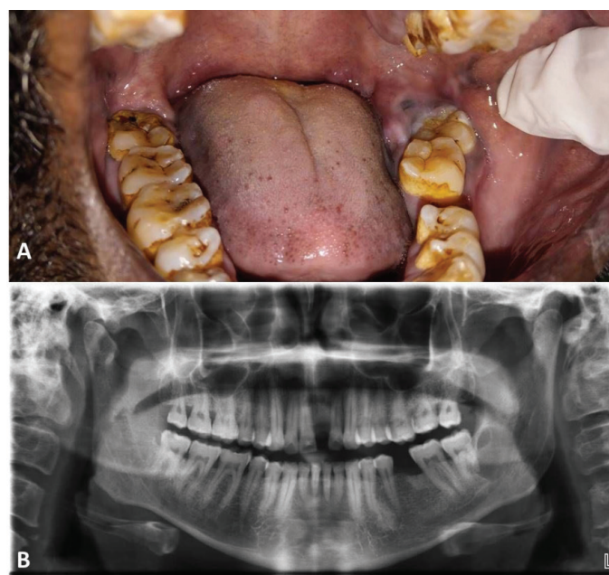
Figure 1A. Intraoral examination showed a bluish white swelling distal and lingual to the crown of the mandibular left third molar causing buccal displacement of the tooth,

third molars were vital on electric pulp testing. Panoramic radiograph showed a well-defined radiolucency approximately 3x4 cms in size distal to the mandibular left third molar. Superiorly the radiolucency extended to the alveolar crest and inferiorly, it surrounded the distal root of the third molar with evidence of root resorption. Medially the swelling was along the distal surface of the third molar and laterally extended around 4 cm distal to the third molar. There were no calcifications or loculations within the radiolucency (Figure 1B).