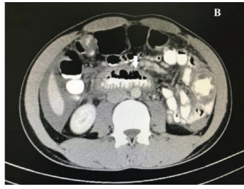
Figure 1 (A). Abdominal CT with oral intravenous contrast demonstrated ascites in perisplenic and perihepatic area (white arrows). (B) . Image study shows multiple segment of large bowel wall thickening (white arrow)

In paracentesis, SAAG (0.4) was non-portal with eosinophilia (70%). There was diffuse eosinophilia in pleural fluid (Figure 2A). In the histopathological examination of biopsy samples, there was edema at lamina propria of terminal ileum and mild, chronic inflammatory cell infiltration accompanied by eosinophils (15-20 eosinophils per field) occasionally involving epithelium (Figure 2B, 2C and 2D).