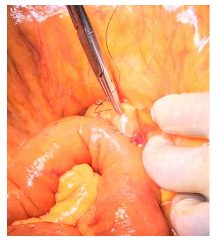
Figure 3. GE was passed through a distinct opening in the transverse mesocolon as retrocolic, and fixed to the remnant stomach and thus, it was provided to remain in an abdomen section apart from the other anastomoses