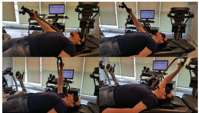
Figure 1. JPS measurement at 30-60-90 and 120 degrees. All assessments were measured with isokinetic dynamometer