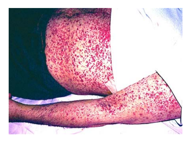
Figure 1. Disseminated papules and vesicles on abdomen and arm.

3). Pneumonia was observed with thoracic computed tomography. The patient's hyperthermia did not respond to teikoplanin, meropenem and intravenous immunoglobulin, dyspnea increased, and he died.