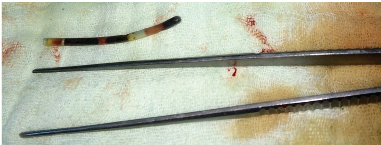
Figure 2: The foreign body removed from the anterior branch of the right portal vein.

Liver transplantation is a multi-staged complex operation including donor hepatectomy, back-table procedure, recipient hepatectomy and implantation. This operation takes more time compared to other surgical operations; many medical staffs participate in the proce-