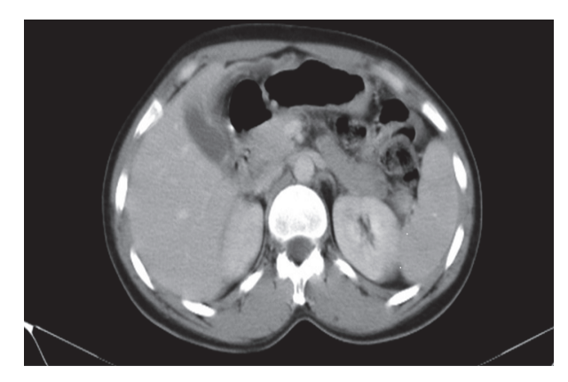
Figure 2. Axial CT images, obtained 2 weeks later from first admission, revealed the disappearance of cystic liver mass with minimal free fluid at the location of previous lesion.

Two weeks later, the cystic lesion previously determined on CT was seen to have disappeared and in its location there was a minimal collection of fluid. In addition, a lobular contoured cystic lesion of approximately 9.5 \times 9 \times 5 cm, not seen on the previous CT image, was determined within the pelvic region adjacent to the bladder and uterus, together with free fluid between the intestinal loops (Figure 2, Figure 3). With these findings, intraperitoneal daughter vesicle was thought to have dropped following the rupture of the hydatid cyst. The intraoperative and pathological findings following surgical intervention supported the radiological evaluation of this case.