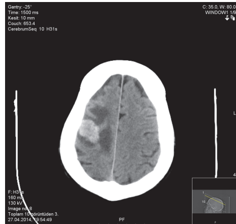
Figure 2. CT image of the patient developing brain metastases.

Lung cancers are divided into two groups: non-small cell cancers and small cell lung cancers. 15-20% of patients have small cell lung cancers. Brain metastases may