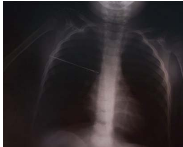
Fig 2 Plain thoracic x-ray shows straight pin in the second patient.