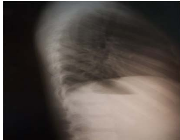
Fig 1B Lateral thoracic x-ray shows straight pin superimposing the vertebral column.

both cases, if the penetration was intentional, one would expect to find the sharp tip of the needle deeper within the tissue and perpendicular to the skin. The