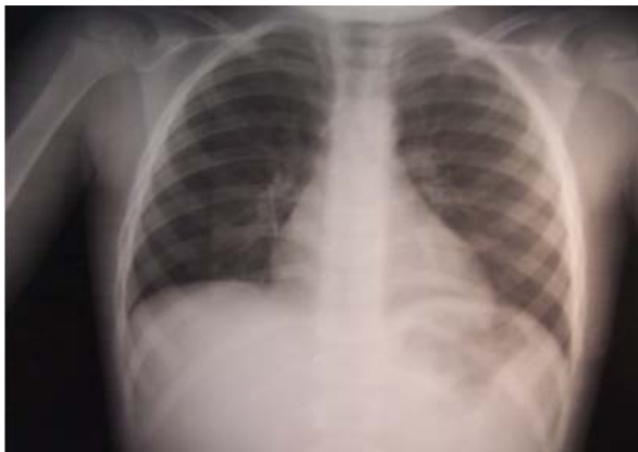
Fig 1A Plain thoracic x-ray shows straight pin in the first patient.