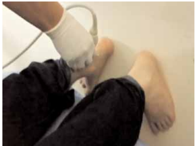
Figure 1. Position of the calf and ankle region in US examination.

IBM SPSS Statistics 22.0 for Windows (SPSS Inc., Chicago, IL, USA) was used for statistical analysis. The test of normality was approved by the Shapiro-Wilk test. Variables were submitted as median values (min-max)