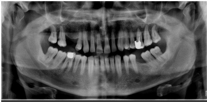
Figure 1. Amalgam filling in tooth 46 in panoramic image