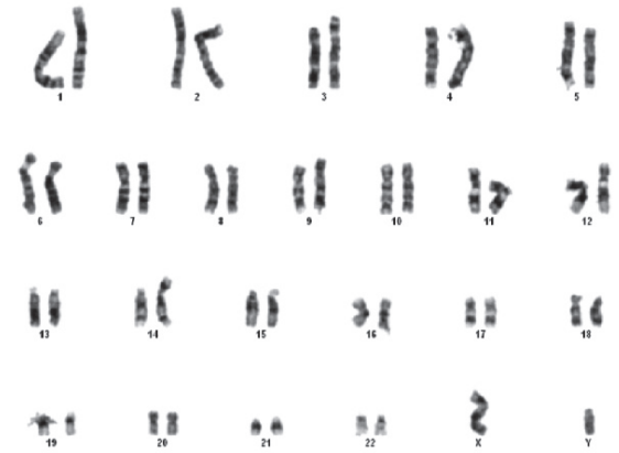
Figure 2. The karyotype image of the second case with DS.

All metaphase areas of Case 2 were evaluated as 46, XY, +21, rob (14; 21) (q10; q10) (Figure 2). Taking into account the possibility that parents might also have Robertsonian translocation, we applied chromosome analysis to the parents. Both mothers had karyotypes of 46, XX while both fathers' karyotypes were 46, XY.