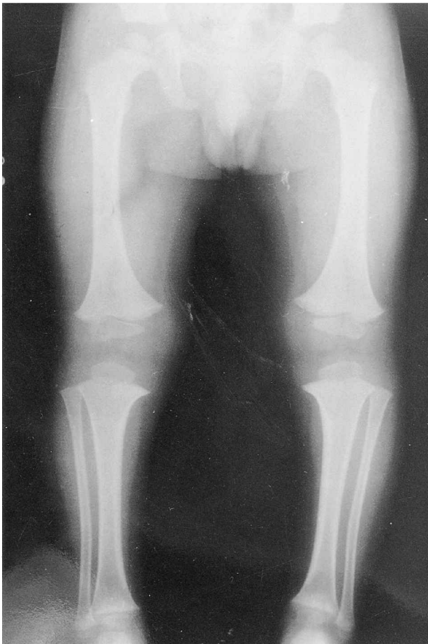
Figure 1. The radiographic images of the legs show the bowlegged deformity, together with widening of the femoral, and tibial metaphyses.