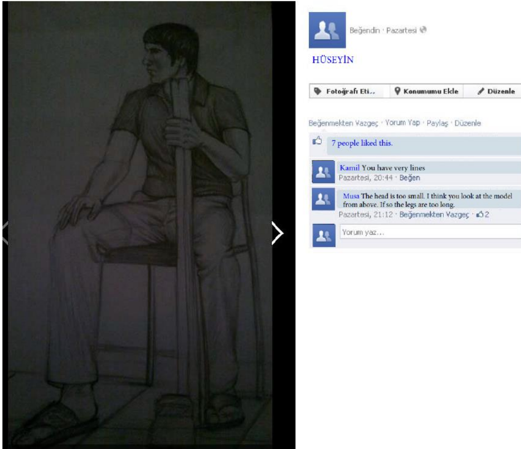
Figure 2. A screenshot of example peer assessment of the painting on Facebook