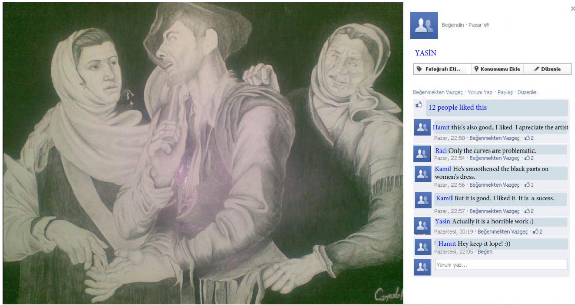
Figure 4. A screenshot of example peer assessment of the painting on Facebook