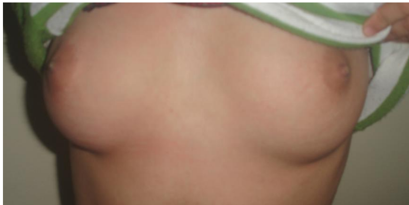
Figure 1. Bilateral hyperpigmented verrucous lesions of the nipples.

We made the diagnosis of NHNA, based on clinical and histopathological findings. The patient was prescribed topical calcipotriol cream applied to the lesions twice a day, but after 4 weeks of therapy no improvement was noted.