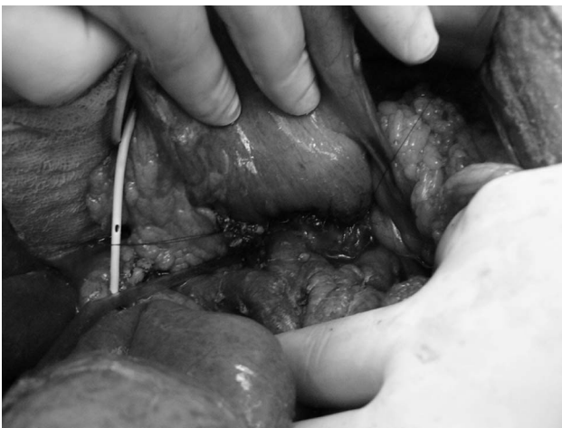
Fig. 4 Anastomotic leak was tested intraoperatively by giving methylene blue via the nasogastric tube.

pylene sutures were passed through the anterior pancreatic wall to the posterior pancreatic wall through the full thickness of the organ (Fig. 3). A Bakes dilator was used to cannulate the pancreatic duct and prevent inadvertent incorporation of the duct with suture. After tying the sutures of the posterior wall, the stump of the pancreas was inverted into the stomach. The anterior side of the anastomosis was completed by passing the sutures that had already been placed through the full thickness of the pancreatic wall into the anterior seromuscular layer of the stomach. Methylene blue was instilled into the nasogastric tube to check for anastomotic leak (Fig. 4). The greater omentum was mobilized from the transverse colon and sutured to the stomach to enclose both anterior and posterior