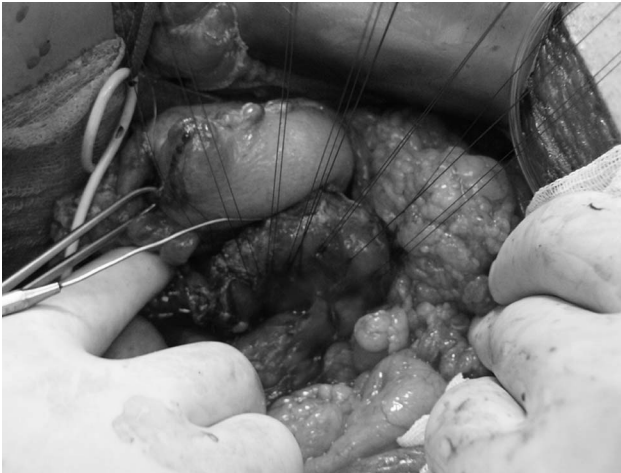
Fig. 3 Sutures were passed from the anterior to the posterior pancreatic wall.

pylene sutures were passed through the anterior pancreatic wall to the posterior pancreatic wall through the full thickness of the organ (Fig. 3). A Bakes dilator was used to cannulate the pancreatic duct and prevent inadvertent incorporation of the duct with suture. After tying the sutures of the posterior wall, the stump of the pancreas was inverted into the stomach. The anterior side of the anastomosis was completed by passing the sutures that had already been placed through the full thickness of the pancreatic wall into the anterior seromuscular layer of the stomach. Methylene blue was instilled into the nasogastric tube to check for anastomotic leak (Fig. 4). The greater omentum was mobilized from the transverse colon and sutured to the stomach to enclose both anterior and posterior