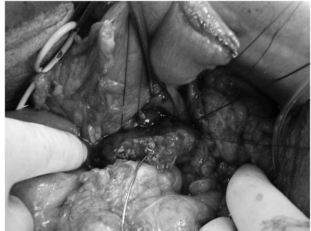
Fig. 2 Sutures were passed through the posterior seromuscular layer of the stomach.

largely due to the pancreaticoenteric anastomosis, the “Achilles’ heel” of pancreatic surgery. 2–4