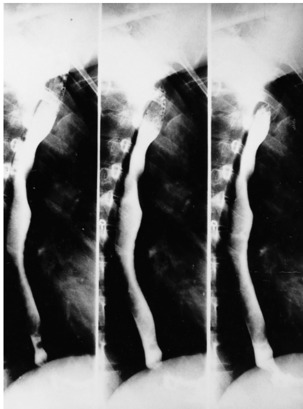
Figure 2. Contrast esophagogram showing no pathologic changes.